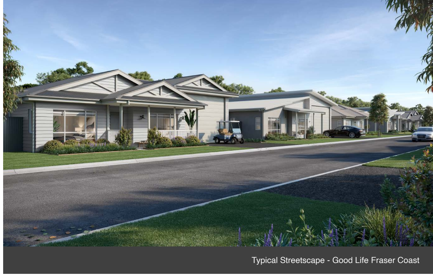
Typical Streetscape - Good Life Fraser Coast