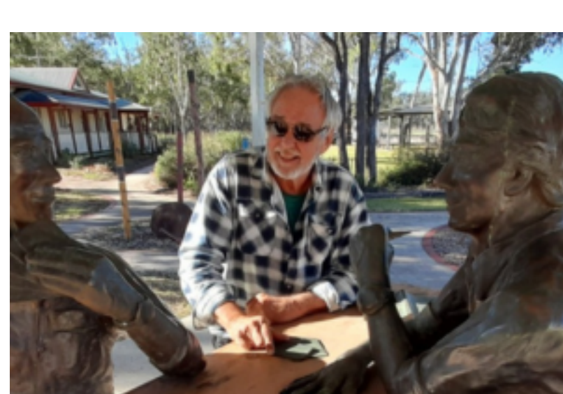
Playing cards with some of the locals at Condamine.