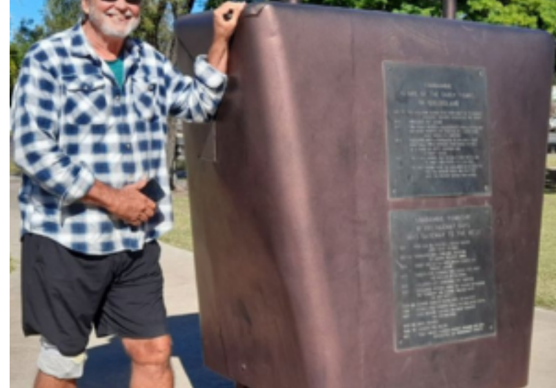
Replica of the Condamine Bell, inscribed with the history of the Condamine Bell Park.