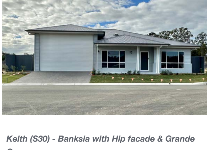
Keith (S30) - Banksia with Hip facade & Grande Garage