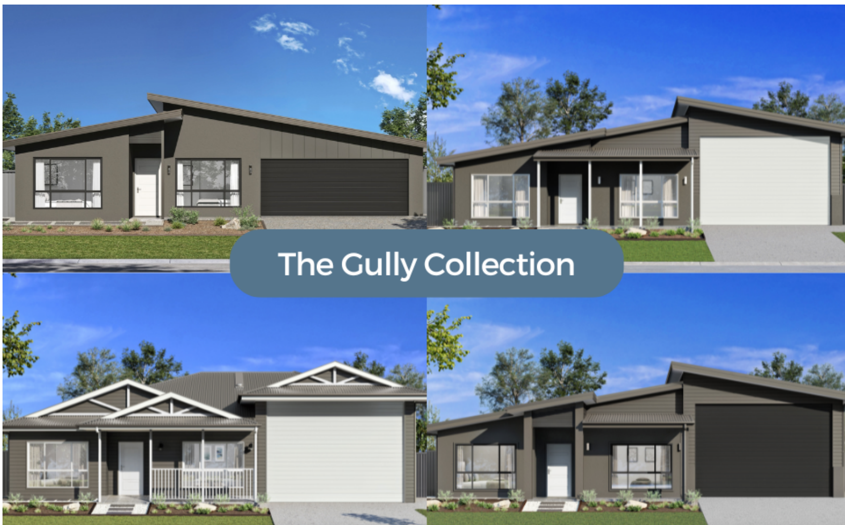
The Gully Collection

All of our available colour schemes are on display at the Good Life Sales & Information Centre. Interested in booking a Resort Tour and learning more? CLICK HERE